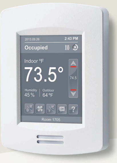
As shown: grey touch screen display with English Language

Optimized performance for temperature control as natural as the perfect spring day!