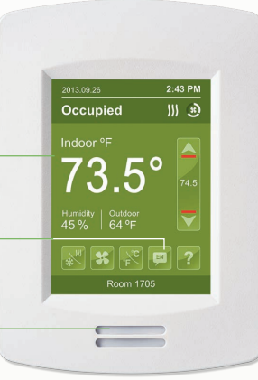
Green touch screen display with English language