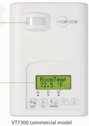
VT7300 commercial mode with occupancy sensor